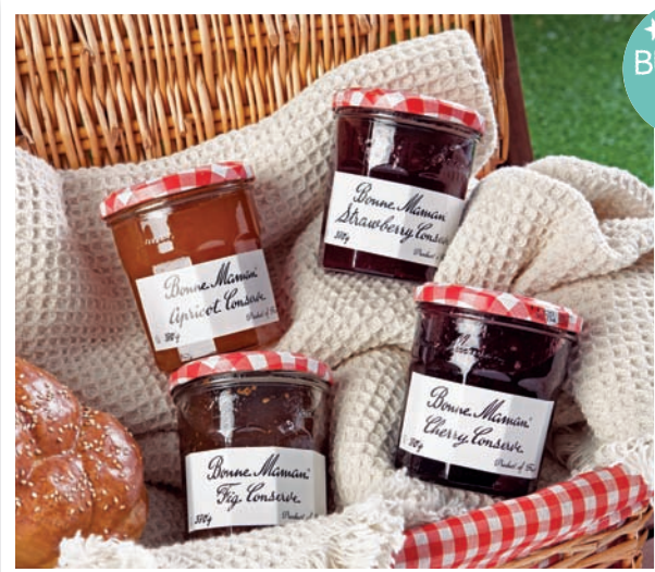
Bonne Maman conserves in apricot, strawberry, cherry and fig, $4.99 each, leading supermarkets.