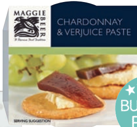
Chardonnay & Verjuice Paste, $4.99 (100g), Maggie Beer.