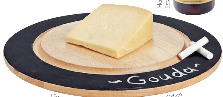
Chalk cheese board made in Thailand, $29.95, Oxfam