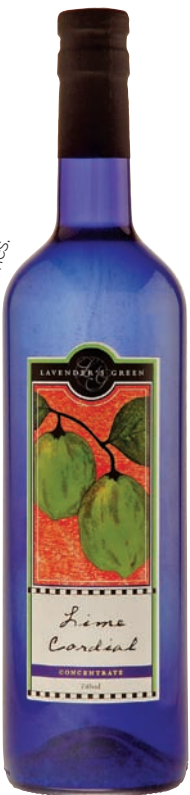
Lavender's Green Lime concentrate cordial, $17.95, David Jones.