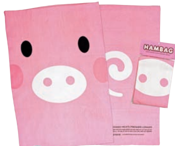
Ham Bag, $14.95, Annabel Trends.