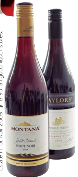
Montana Classic Pinot Noir 2008, $22 and Taylors Estate Pinot Noir 2009, $18.95, all good liquor stores.