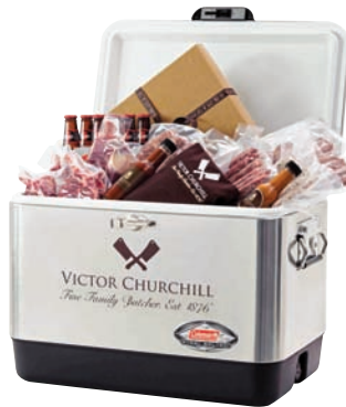
Victor Churchill gourmet esky includes apron, four free-range rib-eye steaks, gourmet sausage pack, six pack of Coopers Sparkling Ale and Victor Churchill house-made tomato and barbecue sauce, $500, Simon Johnson.