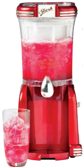
Nostalgia Retro slushy maker, $49, Kmart.