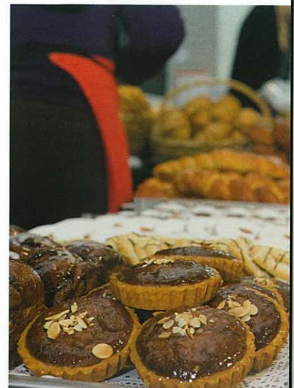
Crowds rugged up and flocked to the inaugural City Market in Wellington in June, which offers local artisan products and producers.